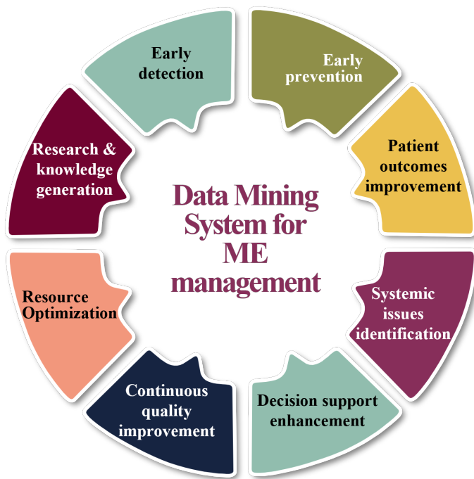
Fig. 1. DM system benefits for ME management

terns and trends associated with ME. By detecting these patterns early, healthcare professionals can intervene promptly to prevent errors from reaching patients, thus improving patient safety and reducing harm.