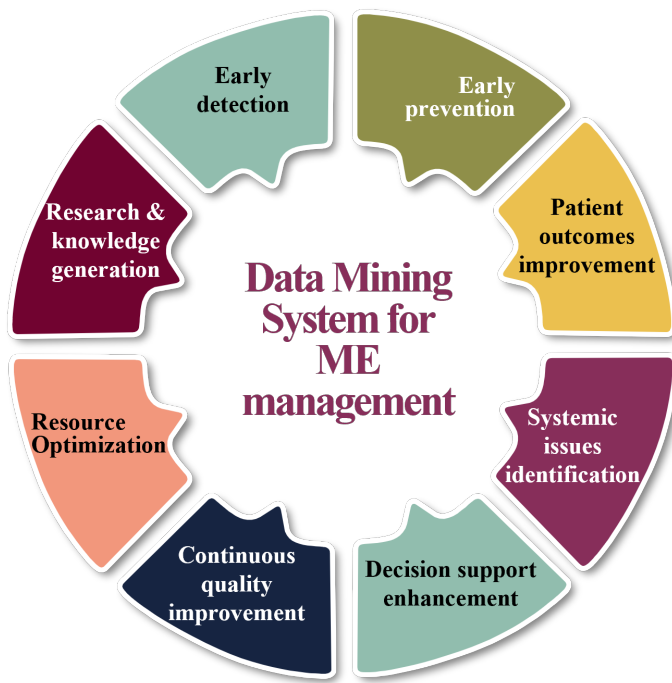
Fig. 1. DM system benefits for ME management

terns and trends associated with ME. By detecting these patterns early, healthcare professionals can intervene promptly to prevent errors from reaching patients, thus improving patient safety and reducing harm.