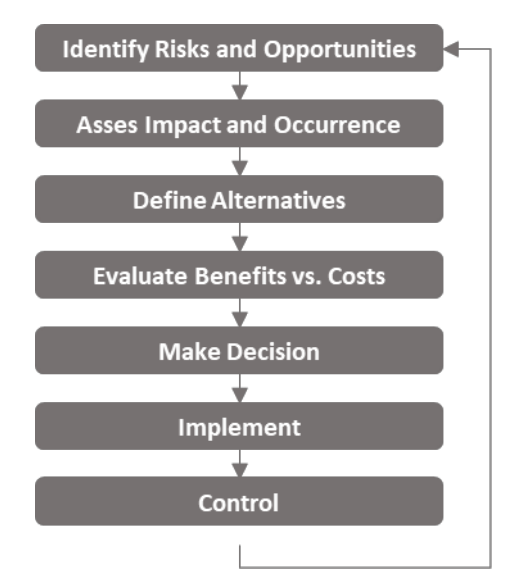
Figure 1. The risk and opportunity management process (inspired by ISO 31000)

Following a traditional risk management lifecycle [ISO 31000, 2009], we suggest a seven-step approach to support our ambition as shown in Figure 1.