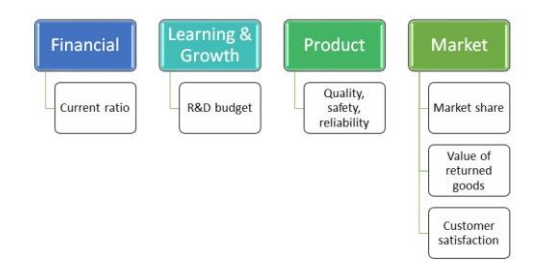
Fig. 3. Vendor KPIs

Putting in mind the two previous KPI examples, a hypothesis can be proposed regarding the relation between the five KPI dimensions and the exchange types described in table 1. Each relation can have a set of KPI characteristics described in the five KPI dimensions point of view. For example, in a vendor customer relation a customer is interested in a set of KPIs (Fig 3) [12]. If the customer has a priority of improving customer satisfaction rather than increasing the revenue, so it's more convenient to collaborate with a company that has a positive feedback from its customers which in return will affect the company's products in customer's perspective.