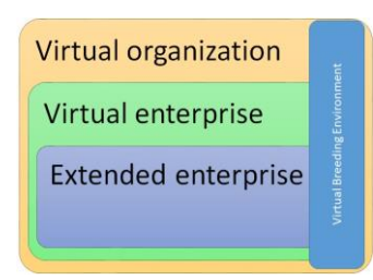
Fig. 1. Network types example