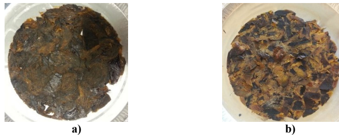
FIGURE 3. The pressed cake condition at a) 92 °C and b) 66 °C

The influence of operating parameters was shown in Figure 2. Temperature was demonstrated a significant effect on the oil yield which in agreement with previous studies on the different oil seeds [9]. The oil yield was increased tremendously from 40 -80 °C. Increasing temperature caused the breakdown in the cell walls and increase in the mass transfer rates. The broken cell led to protein denaturation and coagulation subsequently reduced the oil viscosity. It facilitated the flow of oil from the cell into the inner matrix of mesocarp [10]. However, further increasing the temperature above 80 °C reduced the oil yield by 6% as demonstrated in the Fig 2. The colour of pressed cake also became darker and dry at these temperatures as shown in Fig. 3