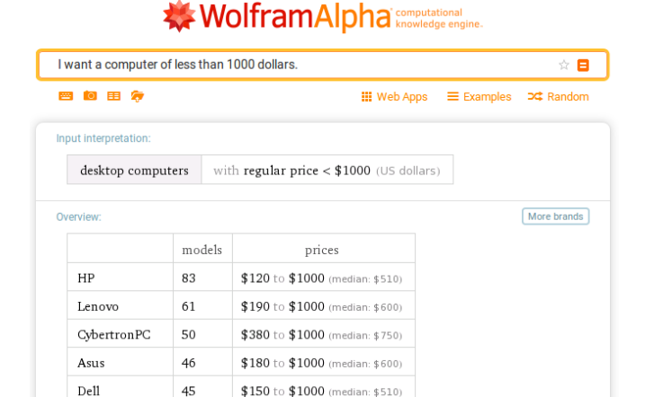
Figure 1. Output example of WolframAlpha<sup>TM</sup> system.

Watson<sup>TM</sup> system is the personality characterization from written speech. To do this, in addition to question answering, different techniques of sentiment analysis [21] are applied. This kind of analysis may be useful to infer expertise level of the user and then behave accordingly.